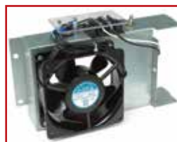
fan/heater kits options available for extreme weather