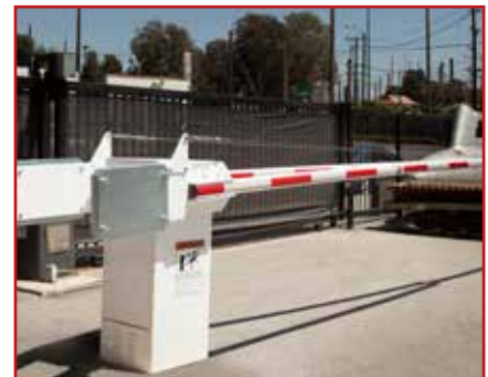
wishbone style aluminum arms up to 27 feet in length