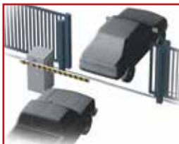
automatic p.a.m.s. sequencing with slide and swing gates